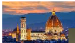
Art and Culture in Florence

TOTAL COST: $5500 (approx. – Final Cost TBD)