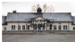
Pay tribute to those whose lives were lost at Dachau Concentration Camp Memorial Site